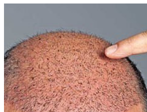
Unique Method May Regrow Lost Hair