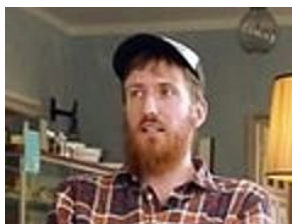
How he achieved fluency in 9 languages