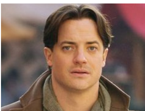
20 Celebrities Who Went Bankrupt